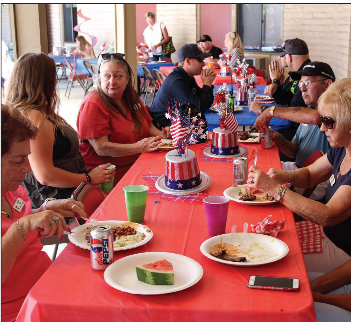
Community Recovery Team members, firefighters and people who lost their homes during the Lilac fire gather for a barbecue at Fallbrook United Methodist Church June 30.